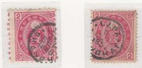
Used in Shanghai 1889 and 1891