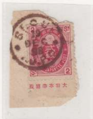
Used in Seoul 1898 with Imprint