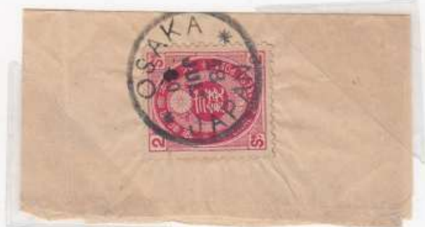
Used in Osaka 1900