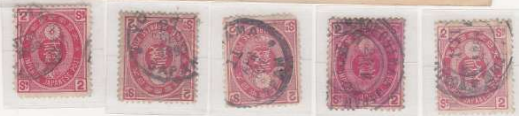
1889 thimble, 1890-91 and 1892-93 Meiji Cancels