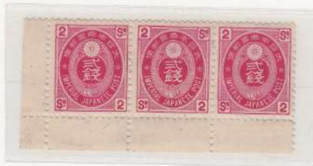
Perf. 12 Strip of 3

みほん (Mihon) or Specimen were issued for display at Japanese Post Offices. This one is perf. 11 Left. (Very Rare)