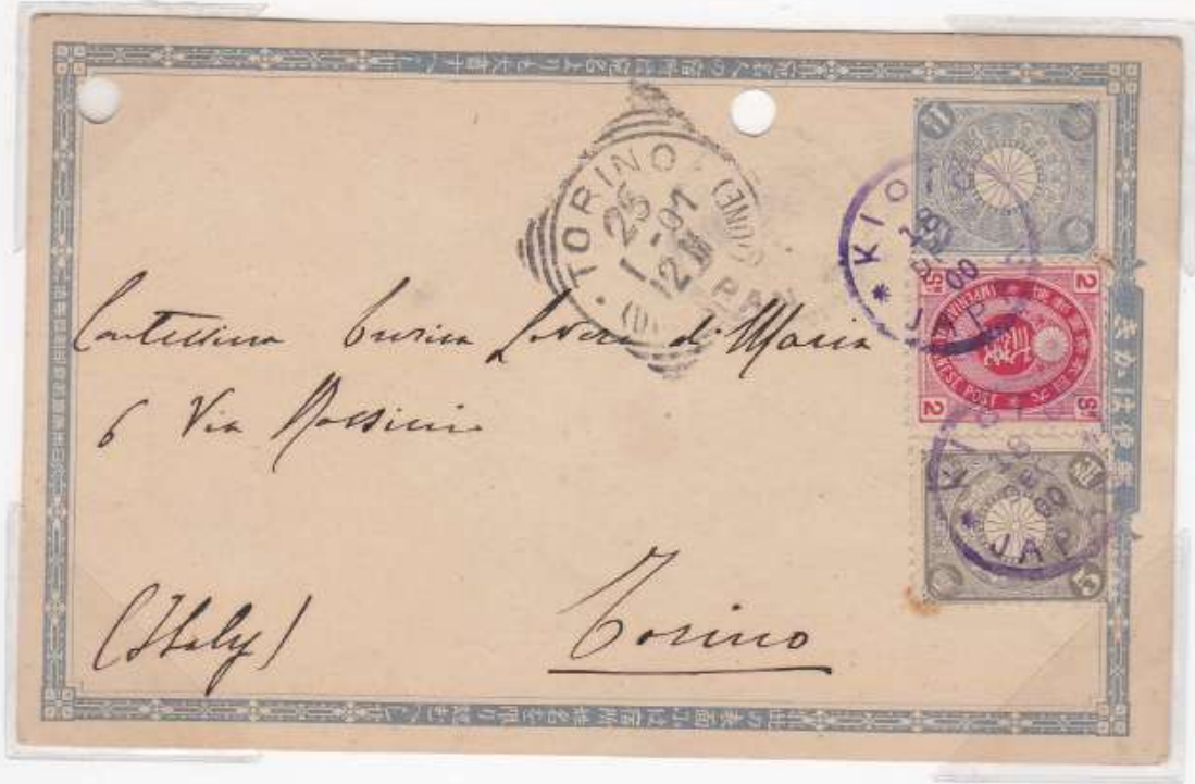
Postal Card: Kioto to Torino, Italy