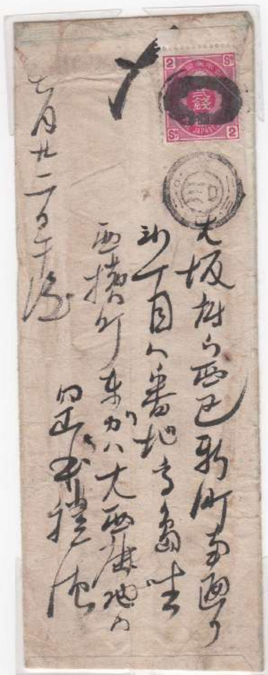
Cover with Osaka Bota