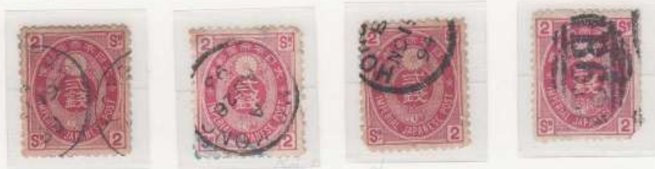
Used in Hong Kong 1889, 1893, 1894 and B62