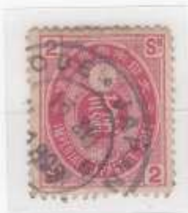
Used in Kobe 1892 and 1894 Meiji