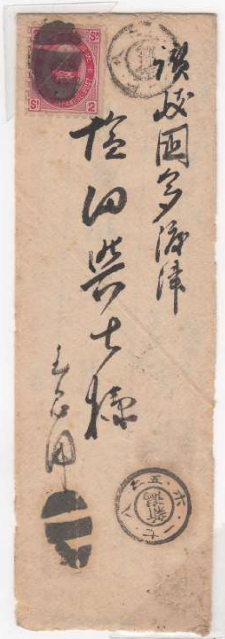
Cover From Nigata to Ehime