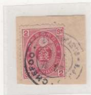
Used in Chefoo 1894