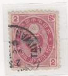
Used in Taiwan