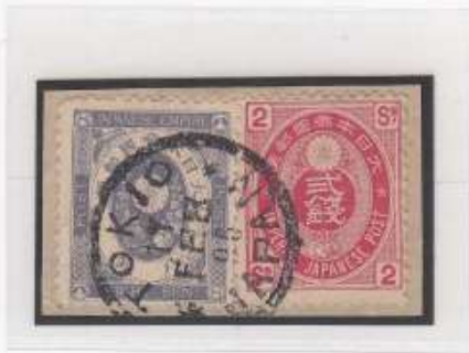
Used in Tokyo