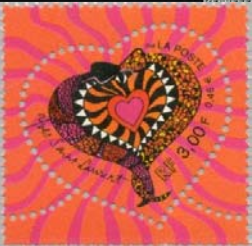
France #2696 & 2697 #2750 designed by Yves Saint Laurent

France wins the creativity award. In 1999 the first heart shaped stamp was issued by France. Two stamps issued in two different formats.