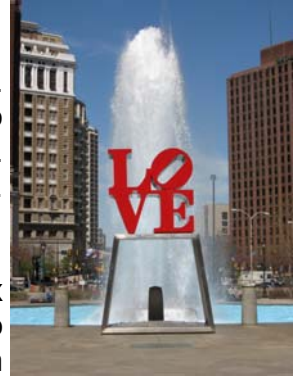
US #1475 Love Stamp And The Love Sculpture by Robert Indiana in Philadelphia, PA

Capitalizing on the Raphael Cherub craze of the 90's, six different issues were created in 1995 and 1996. Two were issued in February and three in May 1995. Some in booklet or pane and in two different denominations, the first class rate (32c) and with the additional ounce (55c), the popular rate for wedding invitations.