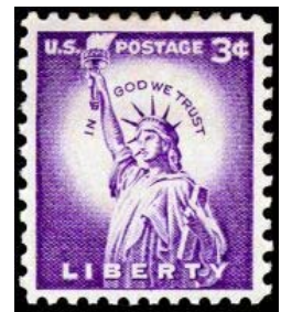
#807 Thomas Jefferson & #1035 Statue of Liberty