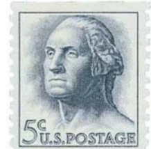
#1208 Flag Over White House & #1229 George Washington