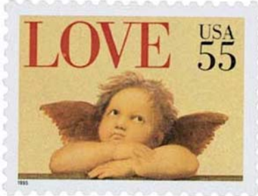
Cherubs from Sistine Madonna by Raphael US #2948 and #2958

One of the most interesting designs came in 2001. Using a rose for the "O" of Love and the love letters between John and Abigail Adams as background, three different designs were created in different formats and denominations.