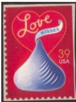
US #4122 Hershey's Kiss

In 2007 love was paired with chocolate. The iconic silver wrapped Hershey's Kiss was depicted on that year's issue. A booklet pane of 20 was issued for the 39c stamp.