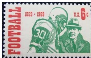
US #1382 Intercollegiate Football, 100th Anniversary

With this being a landmark anniversary year, perhaps we should do something special. Any ideas?