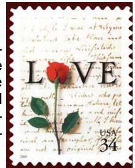
US #3496 Rose, April 20, 1763 Love Letter by John Adams

One of the most interesting designs came in 2001. Using a rose for the "O" of Love and the love letters between John and Abigail Adams as background, three different designs were created in different formats and denominations.