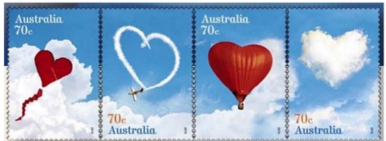
Australia Strip of 4, #4249a

Australia's design in 2015 is very creative. Four stamps, heart kite, sky writing heart, hot air balloon shaped as a heart and finally a cloud shaped heart.