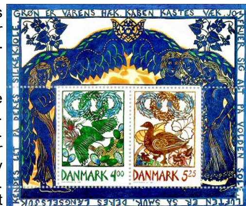
Denmark #1151a Souvenir Sheet

An early reference to Saint Valentine's Day is found in the works of Geoffrey Chaucer (ca. 1343-1400), who states that birds pair on this day. This may have been the idea behind the souvenir sheet, issued by Denmark in 1999 for St. Valentine.