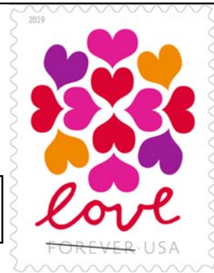
This year's US design Hearts Blossom