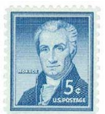
From Liberty Series #1036 Abraham Lincoln & #1038 James Monroe