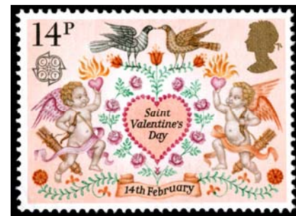
Great Britain #933 Love Birds, Angels and Heart

In 1981 Great Britain issued a stamp about Saint Valentine's Day in a series about folklore. Why folklore? Perhaps because there is so much unknown and a lot of myths behind St Valentine's Day and the man or men behind the lore.