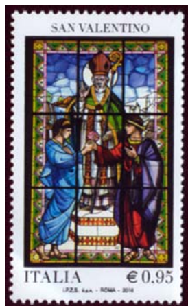
Italy #3365 Saint Valentine of Rome

Italy issued a beautiful stamp about Saint Valentine of Rome in 2016. But which St. Valentine? It is uncertain whether he was one individual or a pseudonym of several persons.